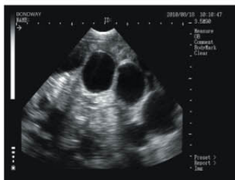
25-day swine gravidity

With a shutter release for easy one-hand operation