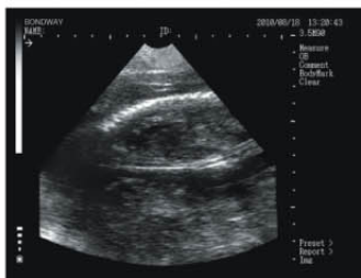
86-day swine gravidity