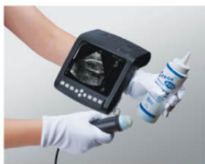
Smart Wrist-top Design